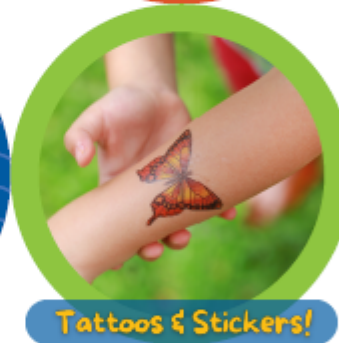
Tattoos & Stickers!

Family Hub - Pearson Road Elementary, 700 Pearson Road, Kelowna