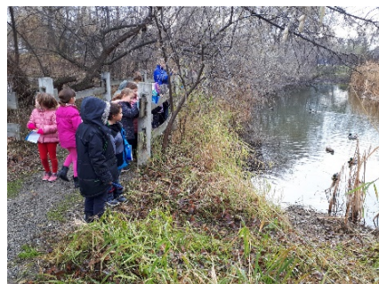
The Burton/Dietzel Learning Community enjoyed their field trip to Chichester Park!